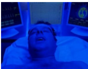
Fig. 5: Matt Parkman having an EEG done in a testing laboratory in Heroes (Series 1, Episode 4, 2006)

In Heroes (Series 1, Episode 4, 2006), a similar scene features a man with mind-reading powers who has been abducted and taken to a testing laboratory where he is strapped to a bed with forehead, wrist and ankle ties. The voiceover begins, ‘Sometimes questions are more powerful than answers – how is this happening? What are they?’ as the camera pans across brain images on a computer screen before resting on the prisoner who has traditional EEG electrodes across his scalp.