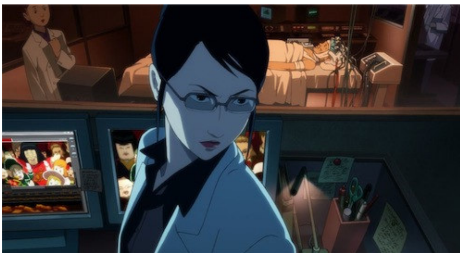
Fig.3: Dr. Atsuko Chiba (the alter ego of Paprika) with a traditional EEG being performed behind her in Paprika (2006).

The EEG also features within an episode of Bionic Woman (Series 1, Episode 4, 2007). Like in Torchwood , the test is carried out on a prisoner strapped down onto a reclined chair lending an air of violence to the procedure. However, it is not an important part of the scene; there is no obvious reason for the prisoner to require an EEG and the electrodes on her forehead are not referred to. The actual brainwaves that can be recorded by the electrodes, which can only be interpreted by experts, are not seen. Instead, several real-time CCTV images of the prisoner including a fluorescent green and black image of a brain can be seen in the background, as shown in Fig. 4, increasing the impression that she is being treated as some kind of specimen.