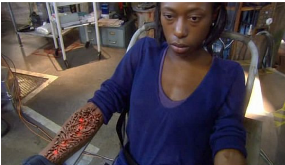
Fig.2: Beth reveals her true identity under the influence of a mind probe in Torchwood (Series 2, Episode 2, 2008)

The probe ‘drills down through [the] consciousness so if there’s anything hidden it’ll pop to the surface’ and the prisoner is warned that it will hurt. Effectively, it acts as a torture method. The violence of this assault upon the mind is foreshadowed by the use of wrist restraints with the captive. The ‘mind probe’ itself is a metallic head cap. Its power to actually affect the functioning of the body is shown visually by flashes of pale green fluorescent neurones and the surge of blood through vessels. The probe causes the suspected alien to groan and scream in agony but serves its purpose; it reveals that she is an alien, as shown in Fig.2, but was never aware of it.